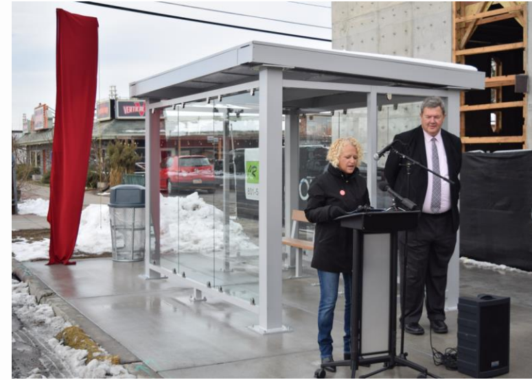
Route 9 first stop unveiling 900 S & 200 W