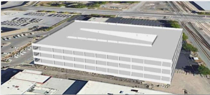
Parking Garage Concept - Draft