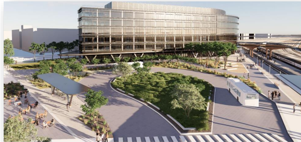
Transit Improvements Concept - Draft